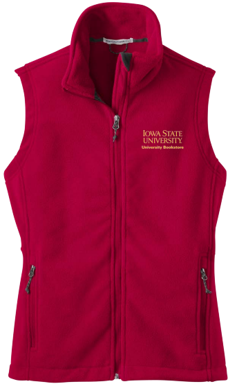
Port Authority® Ladies Value Fleece Vest