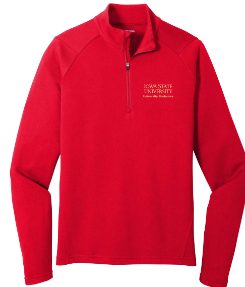
Sport-tek® Lightweight French Terry 1/4 Zip Pullover